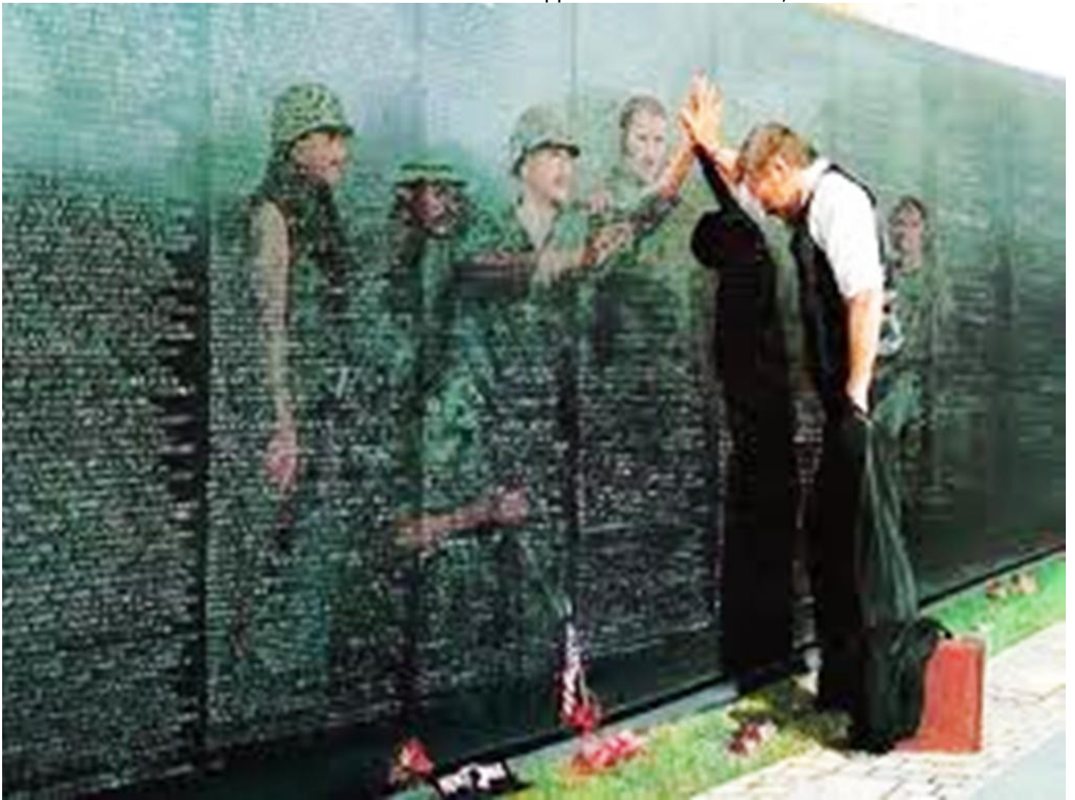
Famous Painting - Veteran Touching hand of buddy on the other side (of the wall)